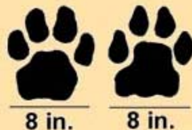
Wind hunter paws: rear (left) and fore (right)

The wind hunter looks like no other predator in the steppes of the Grass Desert. They are tall, standing 18 hands (6 feet) at the withers. They have long necks and long tails that resemble that of a cat. Their heads are dog shaped with short ears and large saber-like canines. They have two horns that extend from the back of the skull. The horns are about 18 inches long and are twisted like a corkscrew. Wind hunters have massive paws with retractable claws used to grab and trip prey. Adult wind hunters weigh between 1500 - 2000 pounds. Their coats are spotted like a giraffes' with dark brown spots covering the neck, body, tail, and the tops of the legs. The face, head, undercoat, and lower legs are a light yellow to golden color. The tip of the tail is usually ringed with three to four stripes of dark brown. Each wind hunters' coat pattern and tail rings are unique, making it easy to tell individuals apart.